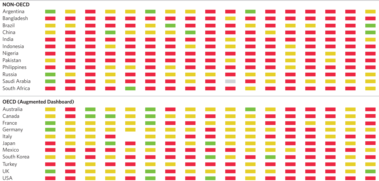
Figure 1 | SDG Dashboards 2016. SDG Dashboard for members of the G20 and other countries with a population greater than 100 million. Dashboards for OECD countries calculated using an augmented set of 77 indicators, compared to 63 global indicators for non-OECD countries. Green signifies that the country has achieved the goal, yellow points to significant challenges that remain and red warns that major challenges must be overcome to meet the goal. Grey indicates an SDG for which there is no data. Icon images courtesy of United Nations.

and detailed in the Supplementary Information, which references all data sources and provides sensitivity analyses showing that the rankings are robust with regard to alternative specifications.