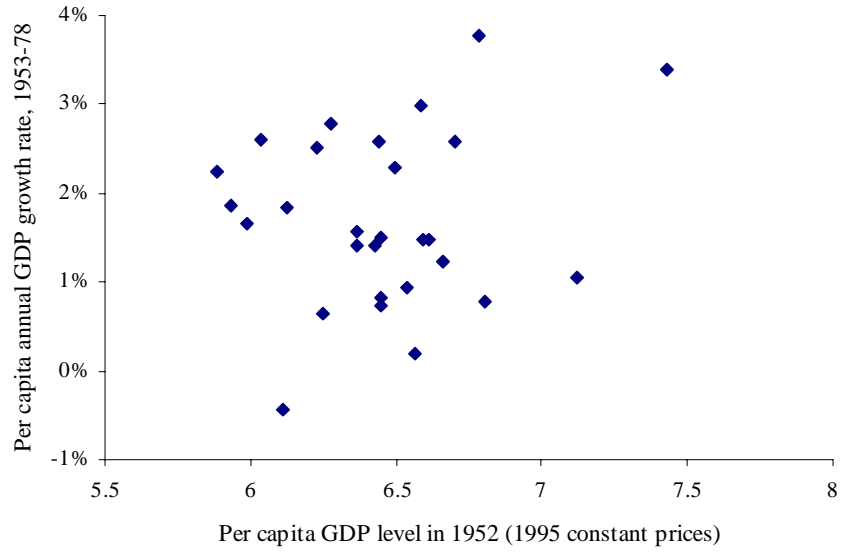
Figure 2. Unconditional \beta -convergence, 1953-78 and 1979-98